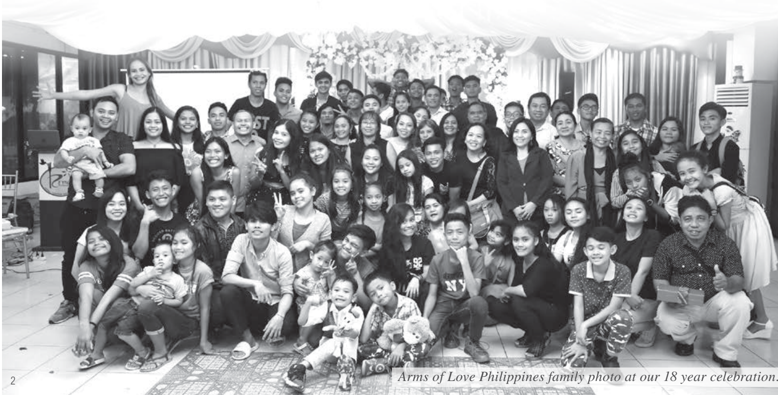
Arms of Love Philippines family photo at our 18 year celebration.

“I am thankful to God, he used so many people to help children like me. Arms of Love has a special place in my heart and I am super blessed that they loved me, taught me, guided me, understood me, and most of all,